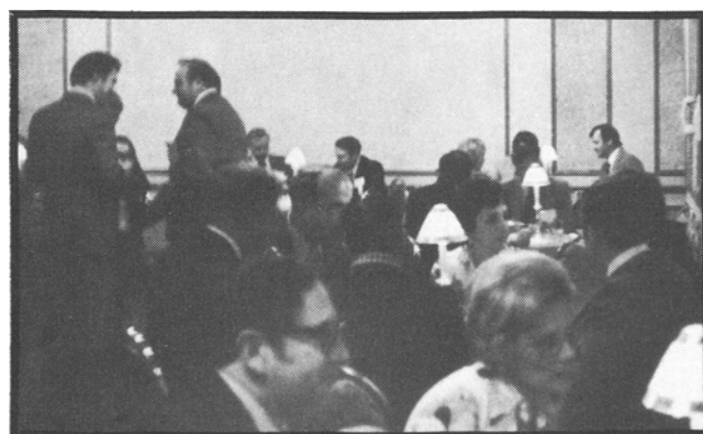
President's Club reception attracted approximately 70 persons