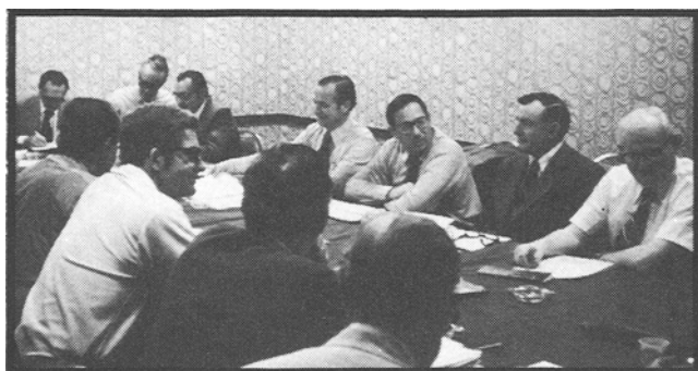
Program and Steering Committee for World Conference on Soaps and Detergents completes its work during New York meeting