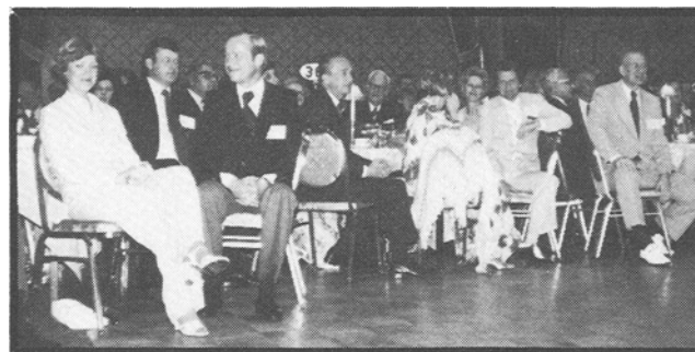
Banquet attendees watch entertainment acts