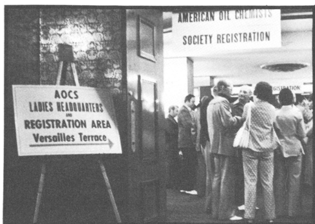
Princess Ballroom Registration area was popular meeting place